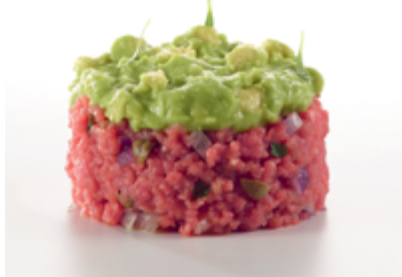
Freshly-prepared tatar with guacamole