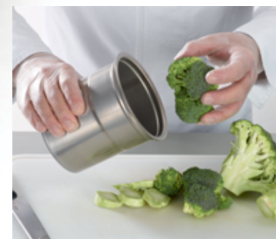
Prepare and fill: Easy preparation of fresh ingredients (cut into pieces, add liquid)

See for yourself: preparing top-quality dishes really is that simple.