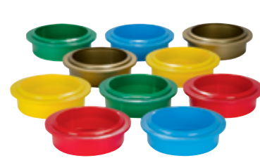
Color-coded beaker lids Set of 10 lids per color

By choosing to purchase a Coupe Set, you can extend the Pacojet 2 PLUS versatility to process fresh, non-frozen foods.