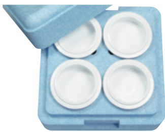
Pacotizing® beakers and lids not included