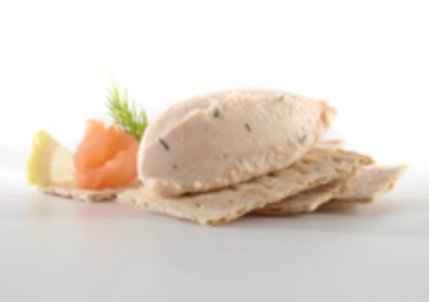
Airy smoked salmon mousse

Further information on the Coupe Set at www.pacojet.com or request our brochure.