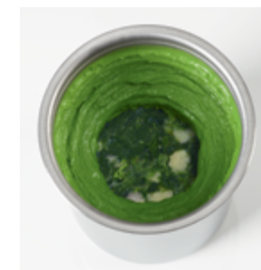
5 x pacotizing®