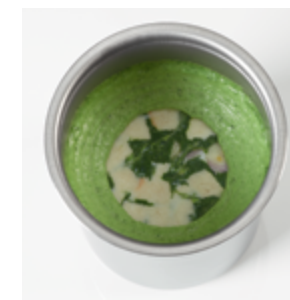
1 x pacotizing®