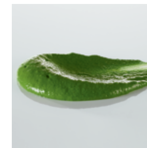
5 x pacotizing® texture