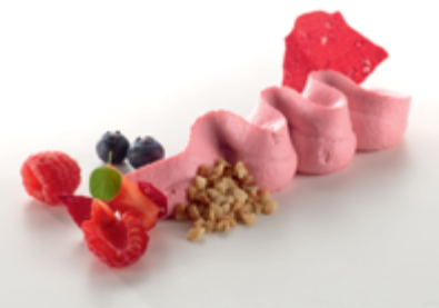
Smooth raspberry cream