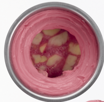
Sorbets & Ice Creams