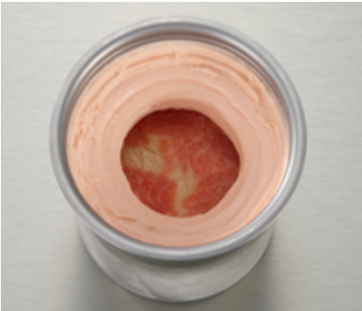
Considerable time savings: Laborious work steps such as straining or cooling in an ice water bath are no longer necessary.