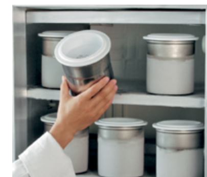
Freeze and store: Freeze for at least 24 h at -20 °C / -4 °F