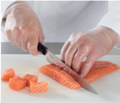
Optimized food costs: Far beyond the fillet – prepare entire meals with next to no food wastage.