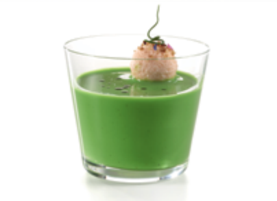
Broccoli soup made from stalks is an example of how Pacojet adds value.