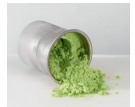
Pacotize® individual portions: For service or mise en place