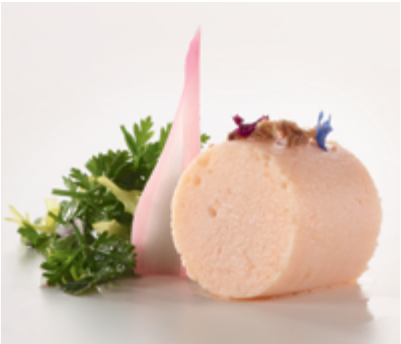
Top-quality results: Guaranteed success – your guests will keep coming back for more.

To choose Pacojet is to invest in your own success. This cooking system maximizes cost savings, reduces workload and eliminates overproduction and food wastage.